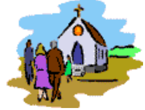
Church Management software