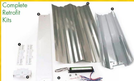
T12 to T8 retrofit kits